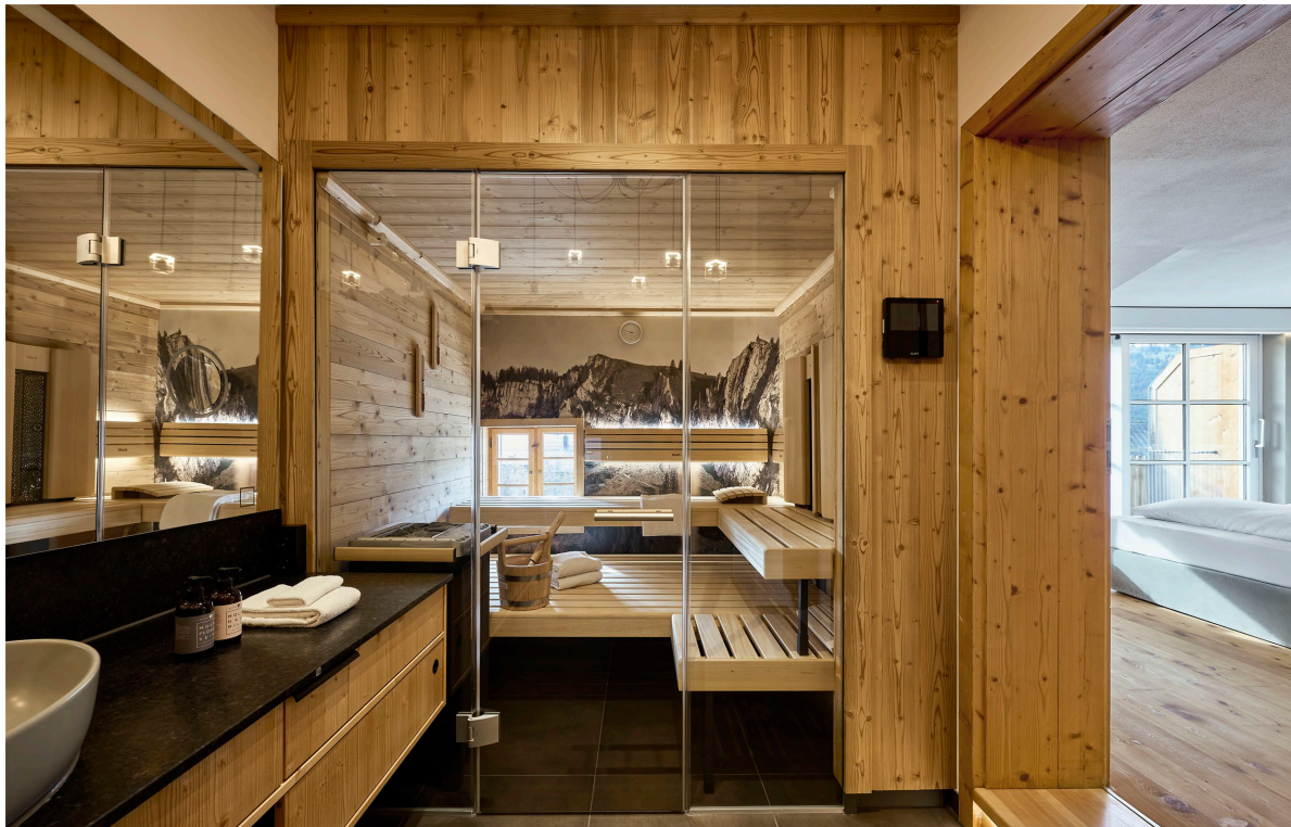
Spa Suite in the HUBERTUS Mountain Refugio

Andreas Erke, Head of Design at KLAFS, on the influence of wellness design