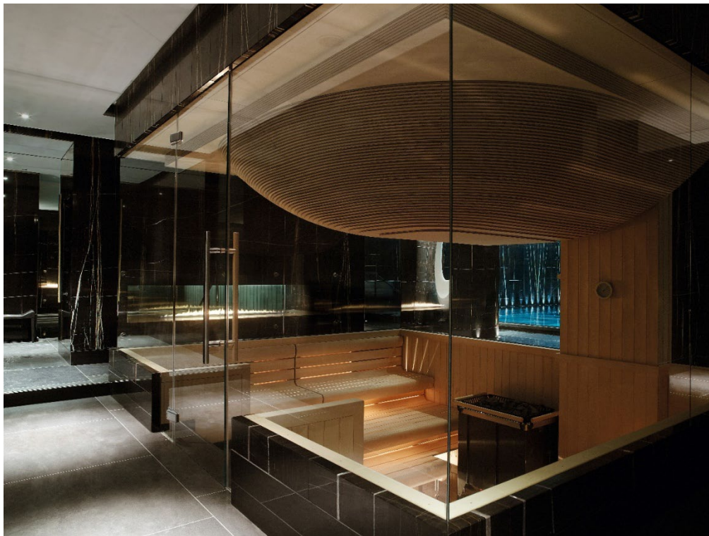
Corinthia Hotel London